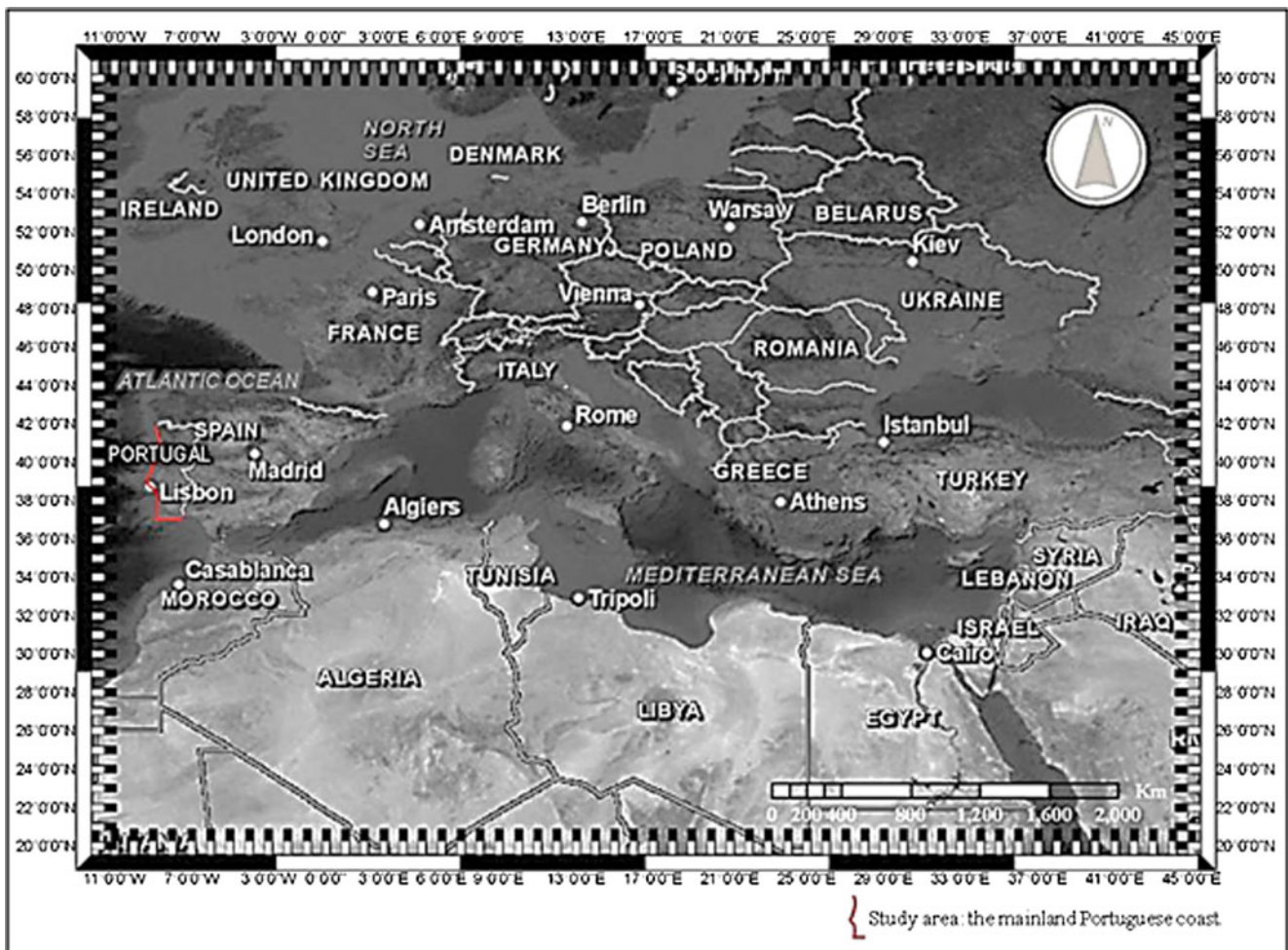
Fig. 1 Study area (the Portuguese coast) in the context of the Atlantic Ocean and Mediterranean Sea.

Great structural, geographic and climatic contrasts can be felt between the North and the South of Portugal. The Northern region is characterized by a rugged landscape and significant rainfall, while the south is flatter and rainier (annual precipitations usually inferior to 800 mm). The Mediterranean character of most territory is tempered by the buffer effect of the Atlantic Ocean. Due to the physical landscape characteristics, significant contrasts between the littoral and the interior of the territory also occur (Daveau 1995).