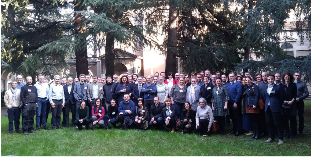
Figure 1.3. ASF-STOP final conference group picture.