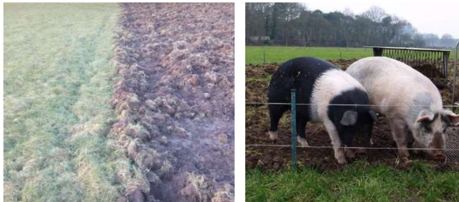
Figure 2: The common impact of pigs on pasture, the boundary between the grass and the bare soil is where the electric fence was placed.

Management of the different elements is a key challenge. As seen in Figure 2 the pigs can be quite destructive to the pasture. Through developing new pasture mixtures, rotational management and breeding for grazing behavior, it is expected that a more permanent pasture can be achieved. Thus, improving forage production and supporting soil health. If a permanent pasture can be achieved, with rows of trees, then additional environmental benefits are also expected to be achieved, such as improved: carbon sequestration, rainwater infiltration and biodiversity. However, these aspects have yet to be studied in detail.