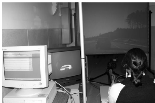
Figure 1. Partial aspect of the devices used in the simulated driving visual perception task

The testing room was lighted by a halogen lamp, so that, at about the subjects' eyes level, there was a illumination of about twenty-five lux.