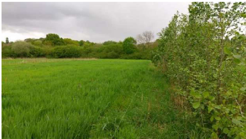
Figure 1: Alder short rotation coppice with oats in the 21 m wide alley (May 2017).

in an organic system. Trees were planted in twin rows, 0.7 m between twin rows and 1.0 m between trees within rows. Tree rows are roughly 3 m wide, with 24 m between tree row centres (i.e. about 21 m of pasture alley). A silage cut was taken once or twice a year for the first four years, and cattle were introduced in August 2015 for two months. A break crop of oats for whole crop silage was sown on 10 October 2016 (at a rate of 185 kg seed per hectare) ahead of re-seeding of pasture in Spring 2018.