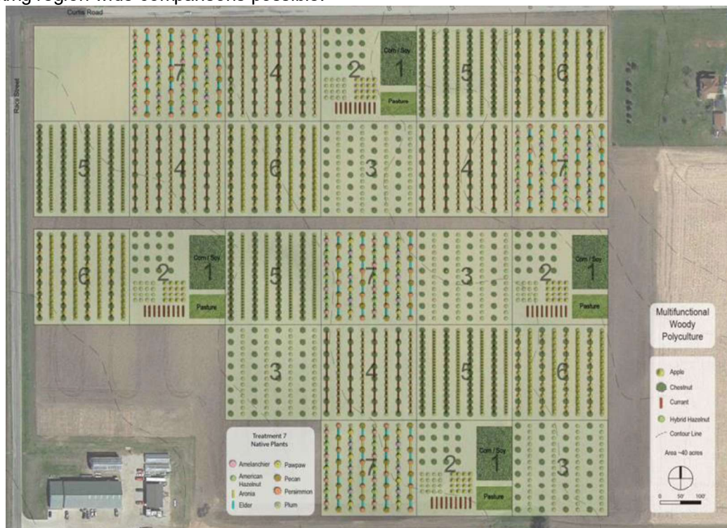
Figure 1: Site layout of the multi-layer alley cropping field trial at the University of Illinois at Urbana-Champaign.

In May 2015, a new 12-hectare multi-layer alley cropping field trial was established in Urbana, IL, USA at the University of Illinois at Urbana-Champaign ( Figure 1 ). The trial contains four replicate plots each of seven treatments, arranged in a randomized complete block design. Each plot is approximately a 0.4 ha square containing eight tree rows spaced 9 m apart with an alley crop of grass-clover hay. The site experiences a temperate, continental climate with a mean annual temperature of 11°C, an average of 18.5 days that reach greater than 32°C, and an average of 122 days that reach lower than 0°C. Mean annual rainfall is 1050 mm, with mean annual snowfall adding an additional 590 mm of equivalent rainfall. The dominant soil type at the site is a silt loam to silty clay loam, with 0-2% slope across the site. The land-use history has been conventional row-crop agriculture (recently, a maize-soybean rotation) for over 100 years, making region-wide comparisons possible.