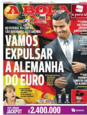
FIGURA 3 – Multimodal metaphor Vamos Expulsar a Alemanha do EURO

The fictive confrontation is staged, in the multimodal metaphoric blend, by metonymically selecting the photos of the two most prominent actors on each side of the imagined conflict, namely Cristiano Ronaldo for Portugal and Angela Merkel for the EU, in a very suggestive TOP/Ronaldo-DOWN/Merkel visually architected layout.