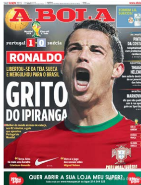
FIGURA 2 – Multimodal metaphor Grito do Ipiranga

However, we have argued that the blended scenarios arise out of the assemblage of the pictorial mode with the written mode, which conveys the counterfactual conceptualization frame. Moreover, we cannot solve the whole puzzle of the blending process without evoking the historical frame underlying the headline, “O Grito do Ipiranga” (“The Ipiranga cry”), which specifically signals a manifestation of joy, celebrating Brazil’s independence from the Portuguese crown in colonial times. On architecturing a newly blended scenario, in which it is Ronaldo who voices the “Ipiranga cry” to celebrate the historical fact that Portugal has conquered the right to play in the Football World Cup in Brazil, the historical frame becomes clearly subverted but in a meaningful way, since Portugal has earned the right to come back to Brazil and play in the Football World Cup, which is in itself a historical fact.