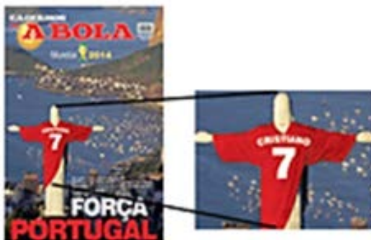
FIGURA 1 – Multimodal metaphor Força, Portugal (transl., Go, Portugal!)