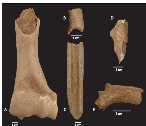
Fig. 2 – Mammal remains from Castro da Azougada showing bone surface modification. A) Left humerus of Bos taurus with an intentional transversal fracture, recovered from UE [9]. B) Long bone of a small mammal with an intentional transversal fracture, recovered from UE [3]. C) Metapodial of Cervus elaphus with a straight longitudinal fracture, most certainly related with marrow extraction, recovered from UE [9]. D) Long bone of a small macro mammal with a chop mark and associated impact flake, recovered from UE [3]. E) Rib of a small mammal with a cut mark on its proximal shaft, recovered from UE [4].

Castro da Azougada faunal assemblage is mainly composed by macro mammals, from which the size group >Very Small Macrofauna is the best represented. This is due to large fragmentation and low species identification. Small Macrofauna is the second best represented size group, whereas Large Macrofauna is the least predominant (Table 1). Cattle ( Bos taurus ) and horse ( Equus sp.) were both identified amongst the Large Macrofauna. The latter species was identified based on a single remain of a left proximal ulna from UE [7]; whereas cattle was mainly determined based on isolated molars and one third premolar, as well as one left distal humerus that was intentionally butchered (Fig. 2A). All cattle remains seem to correspond to adult indi-