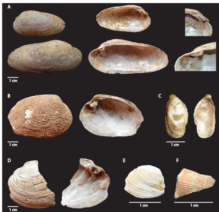
Fig. 4 – Shells from Castro da Azougada. A) First row: Unio delphinus left valve on its dorsal side, ventral side and a detail of the hinge area. Lower row: Unio delphinus right valve on its dorsal side, ventral side and a detail of the hinge area. Shells recovered from UE [9]. B) Potomida littoralis right valve from UE [0] on its dorsal side (with calcareous concretions attached), and on its ventral side, from left to right. C) Testacella cf. haliotidae recovered from UE [3] on its dorsal and ventral sides, from left to right. D) Potomida littoralis left valve recovered from UE [3] on its dorsal and ventral sides, from left to right. E-F) Fragments of shell, probably from the marine family of Veneridae (cf. Ruditapes sp.) due to the sculpture of the shell's dorsal side. Fragments recovered from UE [2] and UE [4], from left to right.

Amongst the Small Macrofauna there is also evidence of pig ( Sus sp.), being impossible to distinguish between domestic pig and wild boar. The identified loose teeth are all incisors ( n = 3 ) and the bone remains consist of one fused left phalanx 1, one right pyramidal and one right distal ulna. The latter shows an unfused epiphysis, indicating the presence of a juvenile.