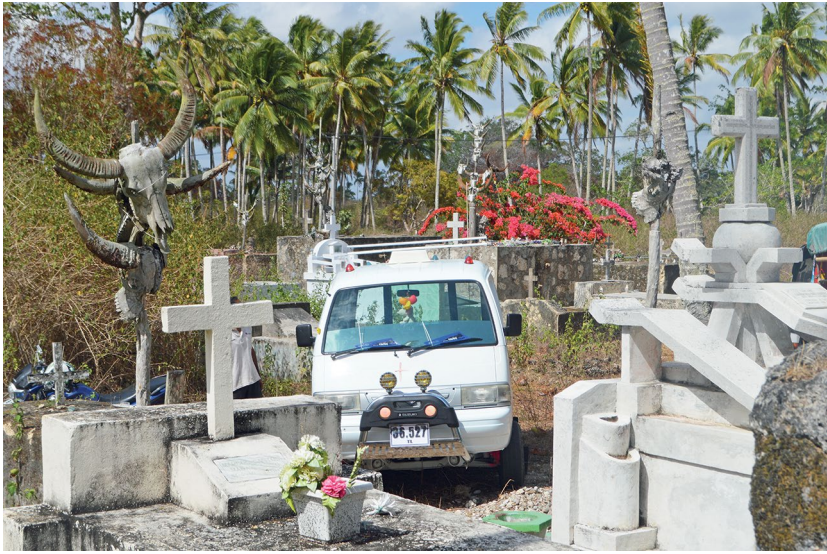
Figure 9.2. The mikrolet next to the graves.