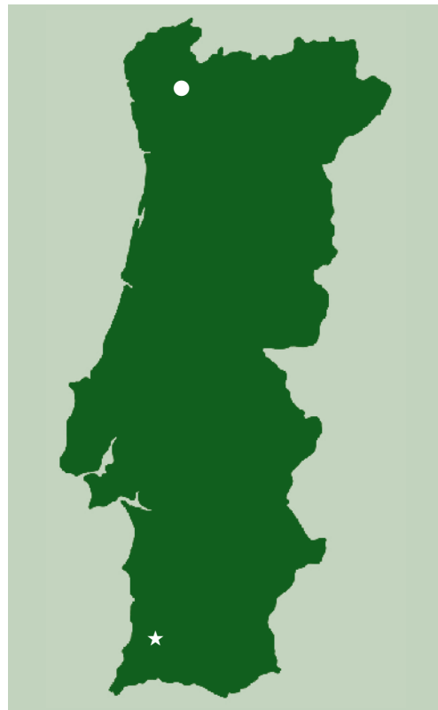
△ Fig. 2. ★, Location of the newly discovered population of R. purpuratum in Portugal; ●, location described by Luisier (1947, 1948).

is 15.64 °C and the annual precipitation is 951 mm.