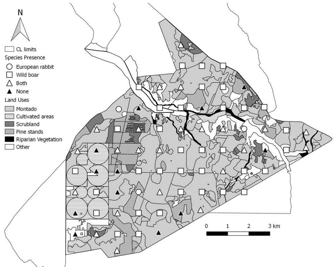
Figure 1. Location of the study area in Portugal and sampling design in Charneca, Companhia das Lezírias (CL) (map created in QGIS 3.12.0, http://qgis.osgeo.org ). Depiction of the main land-cover types and the 73 sampling points (sites), 1 km apart, with species- and site-specific detection patterns (open circles for European rabbit, open squares for wild boar, open triangles for both species and closed triangles for neither).

between occasions. Rabbit and wild boar detections were coded as 1 for detected and 0 for non-detected, which allowed us to build site- and species-specific detection histories. For example, the detection history X_i^A = 001 , means the location i was surveyed on three occasions, with species A being detected only in the last occasion. Overall, we had four sites with missing observations in the last two sampling occasions.