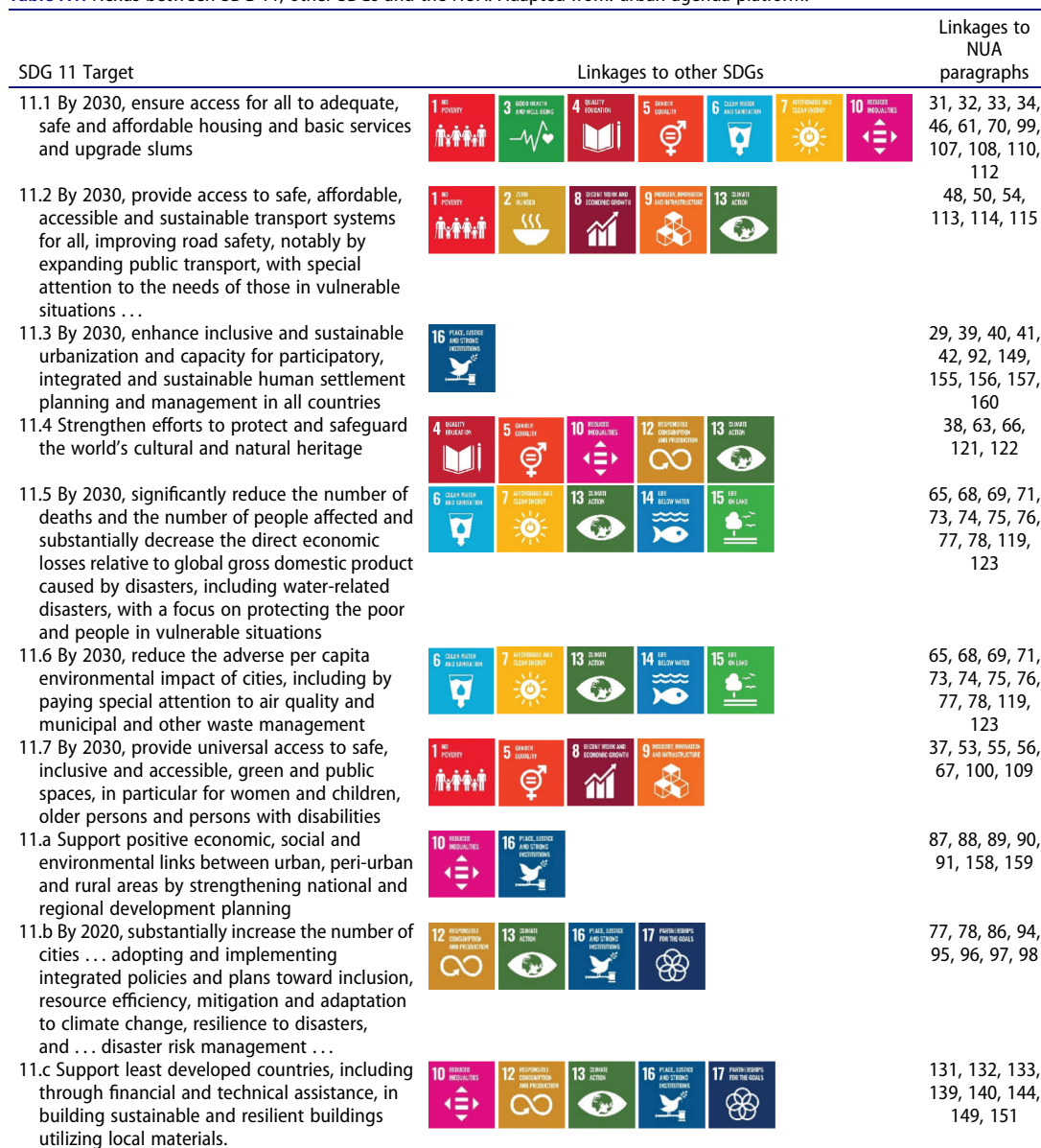
Table A1. Nexus between SDG 11, other SDGs and the NUA. Adapted from: urban agenda platform.