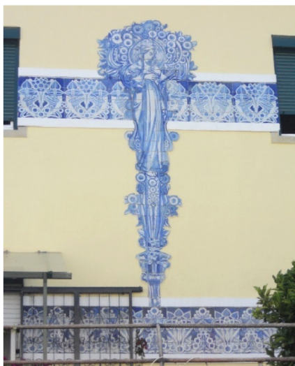
Fig. 8 Man holding a flower in the east facade at one of Álvaro Augusto Machado houses in Estoril. (ACF 2011)

In 1909 the apartment building owned by Doctor Fortunato Jorge Guimarães in Avenida Duque de Loulé, Lisbon, was finished. It was designed by architect Adolfo António Marques da Silva (1876-1939) using some Beaux Arts features blended with a modern approach. The main facade was embellished with a female sculpture by artist José Isidoro de Oliveira de Carvalho Neto (1875-1960) and several azulejo panels by the painter. The ones on the second floor windows had a stylized and curly lines frame and bunches of flowers. These have some resemblance to the flowers painted in the facade of Boulangerie Timmermans in Brussels, which was designed by architect Paul Hankar and built in 1896 (Borsi, Wieser, 1996: 54). Also the same similarity of the flowers depicted can be observed in the lithography F. Champenois Imprimeur dated 1898 by Czech painter Alfons Maria Mucha (1860-1939). The frieze of the building had an Art Nouveau patterned motif of flowers, leaves and bows. The building was demolished in 1965 and none of the artwork has survived (Fevereiro, 2017: 240-241).