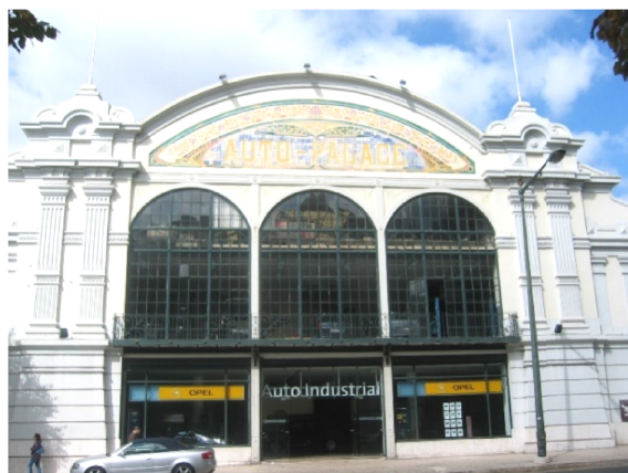
Fig. 3 Auto-Palace main façade and pediment. (ACF 2010)

of Auto-Palace garage in Alexandro Herculano Street Lisbon. The building was built by construction company Vieillard & Touzet , two French brothers in law Fernand Touzet and Charles Vieillard residing in Lisbon. It was especially constructed for cars with an iron structure and designed in a Belle Époque taste. The main facade windows were decorated with stained glass windows by glazier Cláudio Augusto de Azambuja Martins (1879-1919) (Fevereiro, 2017: 249-250), but only two have survived.