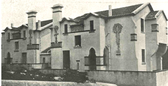
Fig. 5 Álvaro Augusto Machado two houses in Alto do Estoril, photographed in 1910 (Achilles, 1910, Intercalar XIV).

The two houses owned by architect Álvaro Machado (Fig. 5) are similar and inseparable because of the unusual architectural symmetrical design, which is close to the Belgian and German Art Nouveau. In the construction the architect also used some features which are clearly inspired in the casa à portuguesa movement. The original azulejo coating still exists in one of these houses, where we can observe how they enhance again the architectural forms.