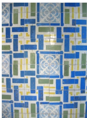
Fig. 9 The azulejo pattern on the balcony at Colégio Roussel, Lisbon. (ACF 2010)

José António Jorge Pinto was one of the few to explore the Jugendstil in his work, for example the azulejo patterns he made for Colégio Roussel (Roussel School). The building was designed in the Romanesque style by architect Álvaro Machado and built between 1904 a 1905 at Avenida da República, Lisbon. The painter ingeniously created for the exterior facades six colourful patterns and displayed them in the following way: one bounding the ground floor; one for the covered balcony; the third for the balcony pediment and three different ones for four windows. All these are inspired on medieval Christian iconography but stilized in the Jugendstil taste. The balcony pattern is made of overlapping squares, thus giving a movement and three-dimensional sense (Fig. 9).