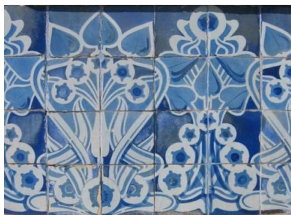
Fig. 7 Azulejo pattern in the east facade at one of Álvaro Augusto Machado houses in Estoril. (ACF 2010)

The east facade has one patterned motif between the door and window of the first floor. It is composed of sinuous lines, stylized plants and circles. The use of various shades of blue convey depth and tridimension, making this complex motif one of the best of his career (Fig. 7). It serves as the base for the masculine figure that ascends from it and holds a small flower on his hand (Fig. 8). All this work proves the perfect relationship between the architect and the painter, as a matter of fact both explored new forms and stylizations throughout their partnership (Fevereiro, 2017: 239-240).