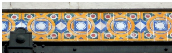
Fig. 11 Azulejo patterned panel at Armazéns Casa do Povo d'Alcântara. (ACF 2011)

of movement and the use of contrasting colours makes them very appealing (Fig. 11) (Fevereiro, 2017: 241).