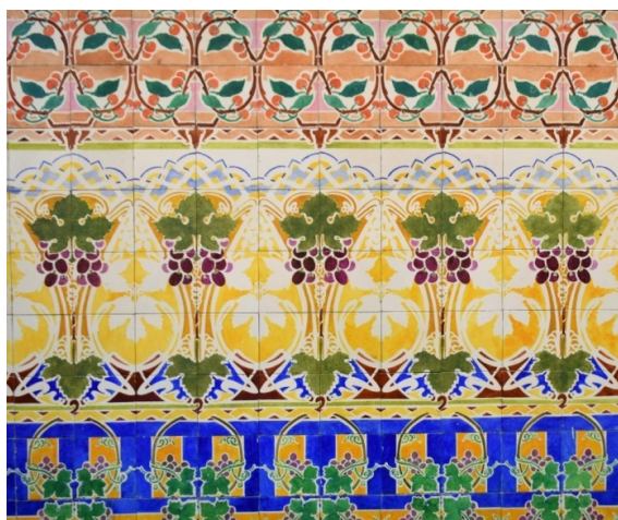
Fig. 10 Azulejo panel at Colégio Roussel refectory. (ACF 2010)

In the following year he made the exterior pediment and bands for Viscondessa de Valmor house, designed by architect Miguel Ventura Terra and also at Avenida da República. The pattern is made out of intertwined zigzags and geometric figures, where sun-flowers and abstract flowers sinously sprout (Fevereiro, 2011: 555-557).