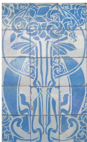
Fig. 6 Azulejo pattern in one of the entrances at Álvaro Augusto Machado houses at Estoril. (ACF 2010)

The east facade has one patterned motif between the door and window of the first floor. It is composed of sinuous lines, stylized plants and circles. The use of various shades of blue convey depth and tridimension, making this complex motif one of the best of his career (Fig. 7). It serves as the base for the masculine figure that ascends from it and holds a small flower on his hand (Fig. 8). All this work proves the perfect relationship between the architect and the painter, as a matter of fact both explored new forms and stylizations throughout their partnership (Fevereiro, 2017: 239-240).