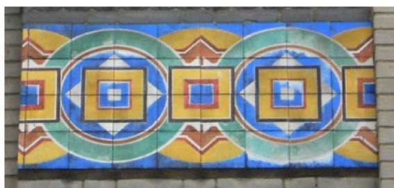
Fig. 12 Azulejo patterned panel at A Napolitana. (ACF 2011)

The painter later in 1909 used the same intricate conjugation of figures in the main pasta building of the industrial factory A Napolitana (The Neapolitan), also in Alcântara, and made by the same previous builders. The rectangular panels were placed on each of the large windows, thus bounding again the facades. Here the use of contrasting colours and expressive paint brushes gives a perception of dynamism and depth. The colours used allude to the ones on the Italian flag (Fig. 12) (Fevereiro, 2016: 69-71).